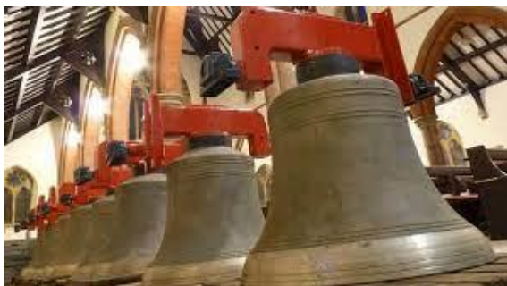
The eight bells of St James, Barrow-in-Furness awaiting rehousing in the tower.

The CCCBR weekend meeting at Brailes (6, 29cwt.) in 2002 was enlightening, to discover how a bell hanging and ringing can influence the dynamics of a bell tower, ably interpreted by expertise from Taylors.