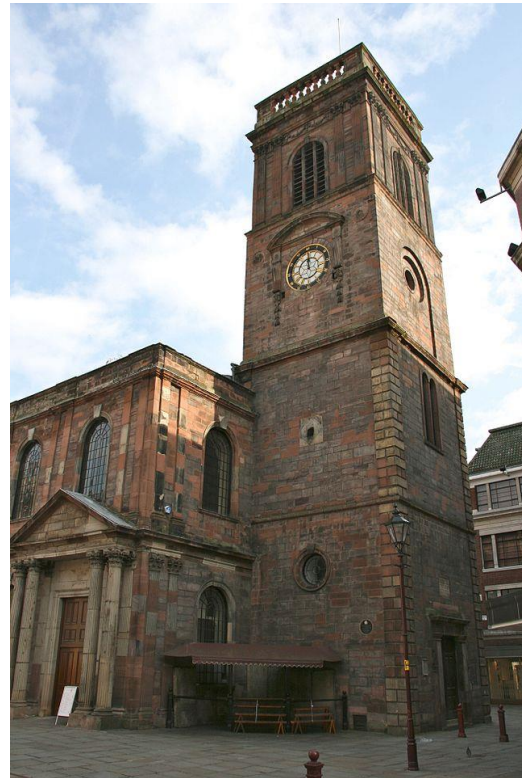
Above: St Ann's as it was in the mid eighteenth century (left) and as it appears today (right).