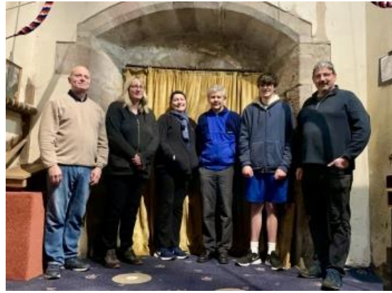
The ringers at Garstang, after completing their quarter of Beverley.