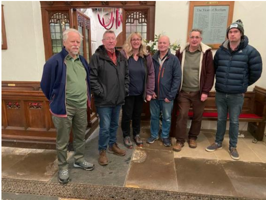
The band at Beetham at the conclusion of their quarter of Kent and Oxford.